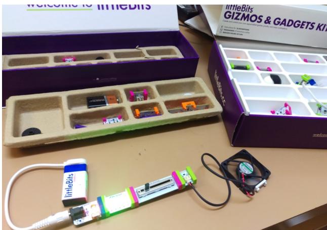
Little Bits play

We have Raspberry Pi's with Raspbian OS installed. This comes with a free version of Minecraft that students can learn to make "mods" using guided lessons on Python programming.