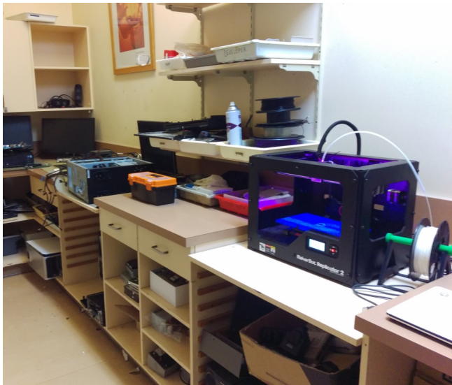
Makerspace room 2.0

donated Lego/meccano sets, and or designed components printed on our 3D printer - this is all one needs to invent prototypes of any innovative technology idea they might have.